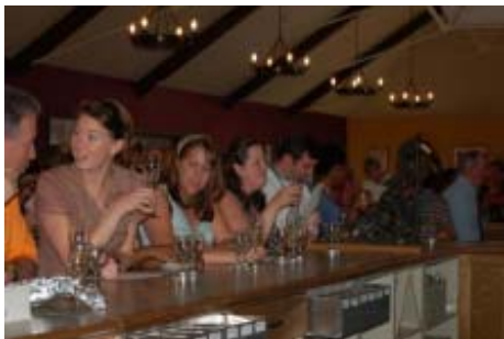
Free time at the Biltmore Estate