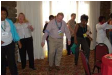
Members enjoy one of many networking events

One hundred and fourteen NCACE members converged in Asheville in May to network, grow professionally and explore the obstacles, innovations, and opportunities that impact how we work together and provide services and career opportunities for students.