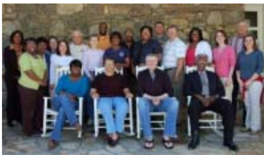
2007 Conference Committee

In addition to dynamic keynote addresses, enlightening sessions, fun excursions and “suite” networking events, participants engaged in “The Amazing Challenge.” This twist on traditional conference formats afforded attendees a unique experience: Members worked in teams to accomplish a series of competitive tasks throughout the conference. Along the way, they broke out of comfort zones, fostered new relationships, and unlocked their creativity and team synergy in ways rarely witnessed at conferences.